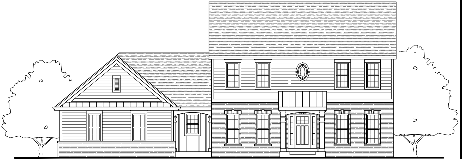
CLASSIC COLONIAL ELEVATION